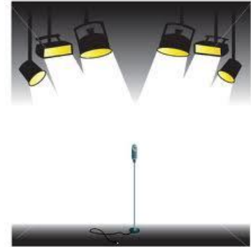
EXHIBIT - $6,500

DRINK TICKET Sponsored by YOUR COMPANY LOGO HERE